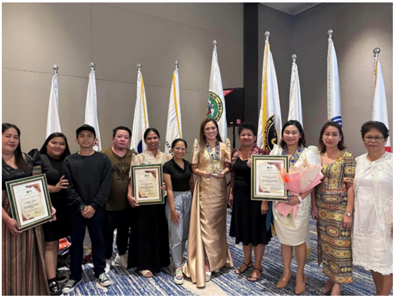
Tayabas' best nutritional practices include the institutionalization of the First 1000 Days of Life Program which ensures that all of the pregnant mothers were assisted from the check-up procedures, laboratory tests, distribution of vitamins and supplements, assistance in breastfeeding; supplementary feeding programs for different age groups, lactation hubs in each establishments, Gulayan sa Barangay, accredited adolescent centers, food fortification, among others. (Tayabas City LGU)

Since 1978, the NNC has been conferring awards, inclusive of trophies and cash prizes, to LGUs and BNSs to applaud their exemplary performance in implementing programs and improving the nutritional status of the people in their communities, particularly infants, children, and mothers. (CCM,CH/PIA-4A)