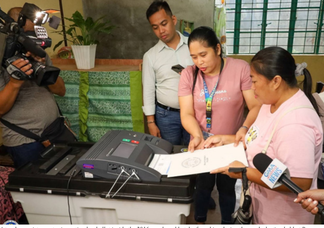
A teacher assists a voter in casting her ballot inside the 2016-purchased batch of machine during the mock election held at Barangay Paliparan III, Dasmariñas City, Cavite on Tuesday (Aug. 8, 2023)

"Wala pong guarantee na ganun dahil matatagal na itong Continued on page 2