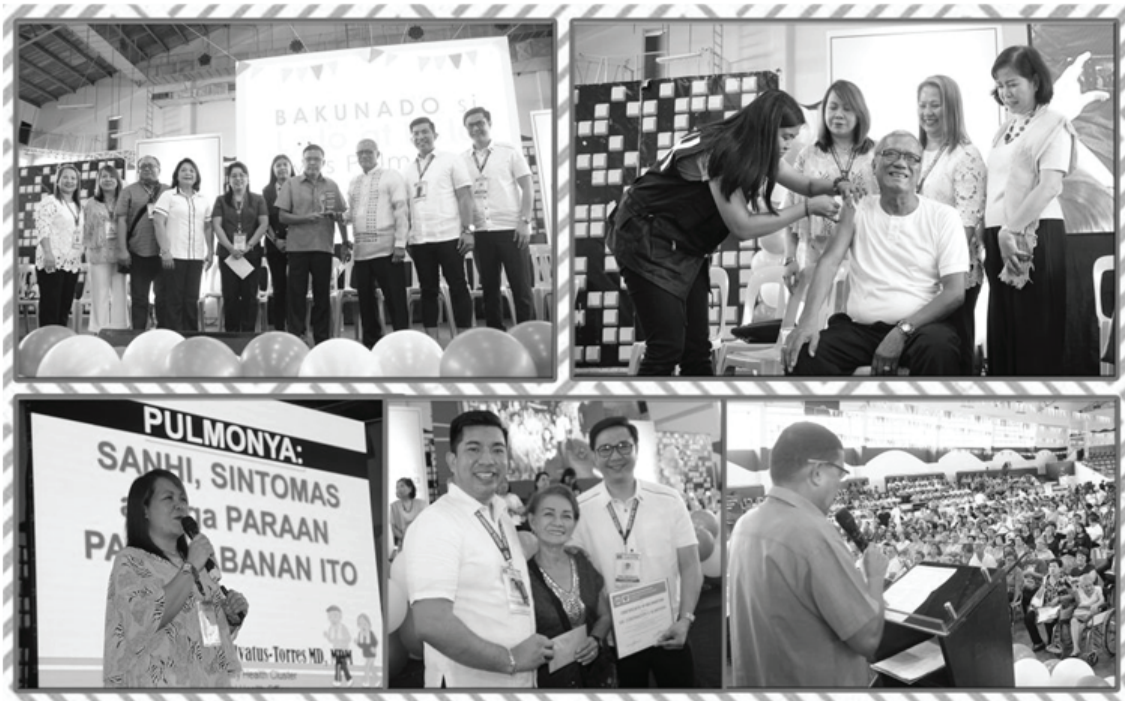
Cavite celebration of Elderly Filipino Week

IN recognition of the significant role and contributions of our elderly in nation building and appreciation of the responsibility of senior citizens' key leaders in the promotion and protection of the rights and welfare of the elderly, the Provincial Government of Cavite thru the Provincial Social Welfare Development Office led the annual Elderly Filipino Week Celebration with the theme: "Healthy and Productive Aging Starts With Me" held at the Provincial Gymnasium in Trece Martires City on November 18, 2019.