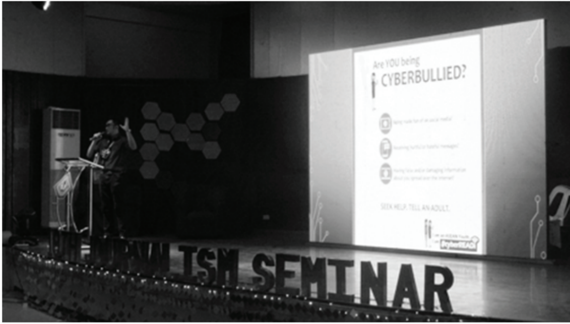
PIA IV-A discusses the #CyberREADi campaign to students of the Cavite State University Main Campus during the journalism seminar themed "Internet Generation: Flexing Convergence in Journalism".