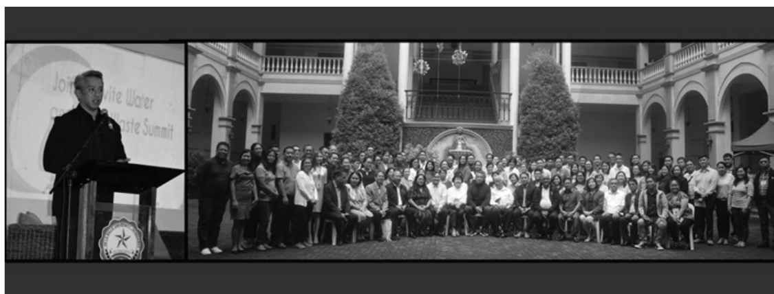
THE JOINT WATER AND SOLID WASTE SUMMIT 2019

Cavite Governor Jonvic Remulla showered the attendees continue to page 6