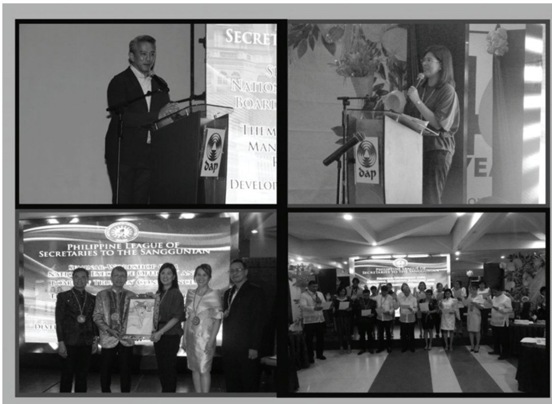
Seminar-Workshop cum National Executive Officers' and Board of Trustees' Conferences in Cavite