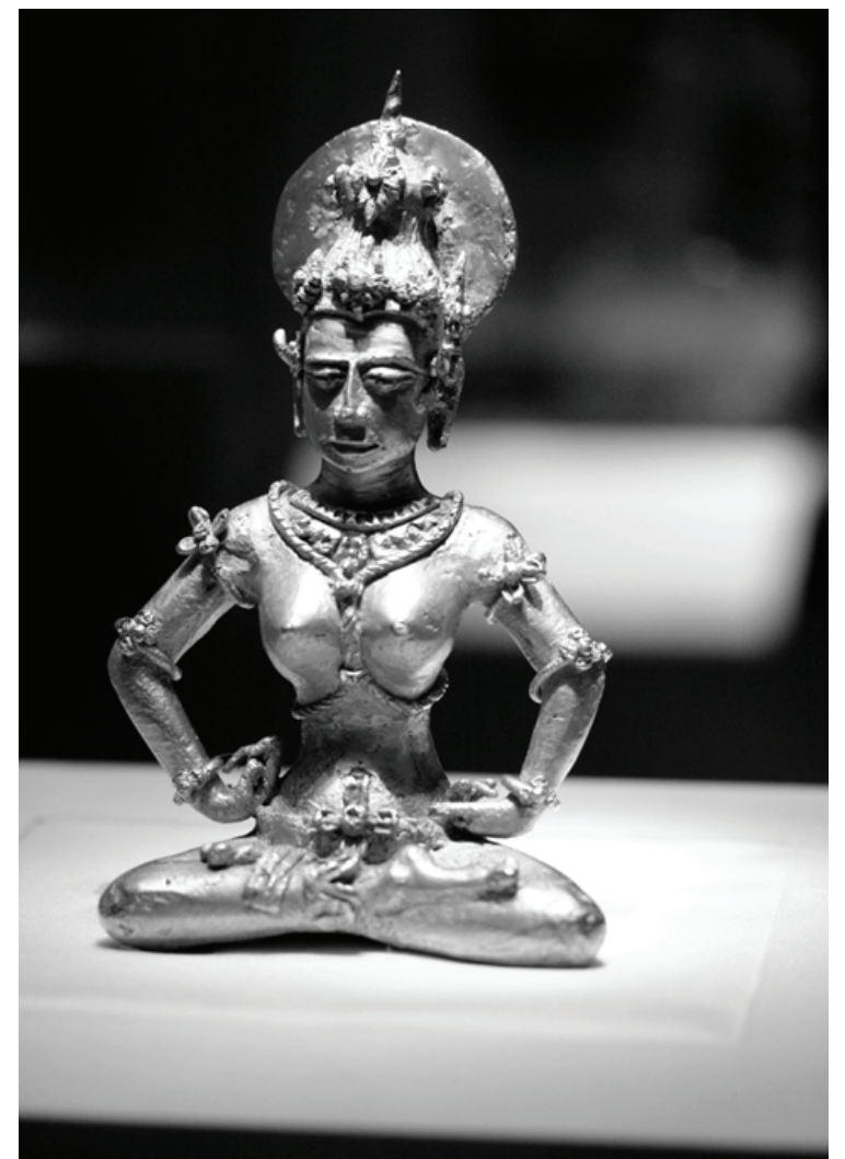
Photo of The Golden Tara of Agusan

Clerics possessing power far beyond their ecclesiastical duties, which ultimately corrupted them and catalyzed Jose Rizal to write a novel of revelation on colonial priestly rapacities. The revelation became the battle cry of a revolution. (Peter Jaynul V. Ueckung (Sept 2012))