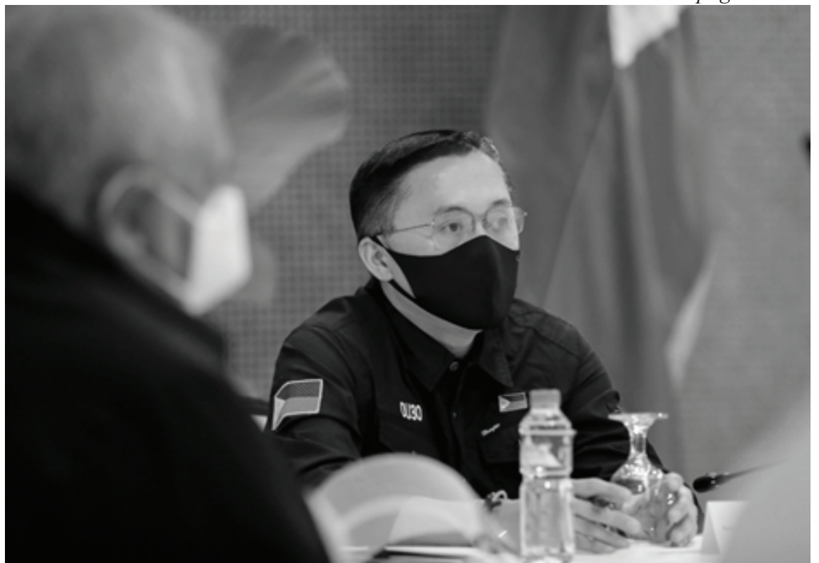
Senator Bong Go said that the government is exploring all possible sources of vaccines available to immunize Filipinos against the COVID-19.