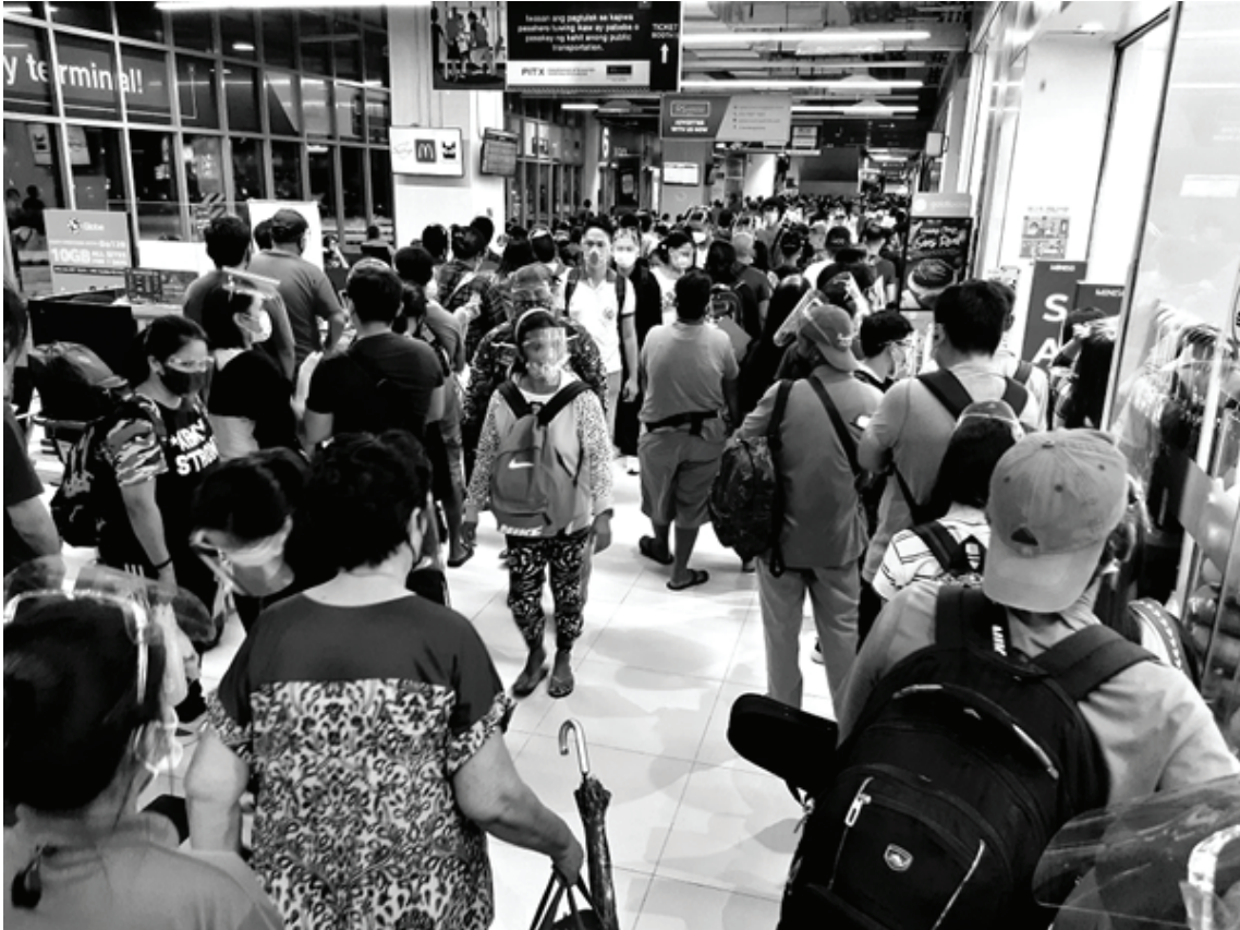
Kuha sa loob ng PITX sa bisperas ng Pasko nitong Huwebes