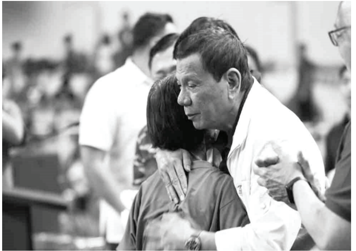
President Rodrigo Roa Duterte during a public event.

To recall, this is the first Christmas celebrated in the Philippines in recent history under a global health pandemic.