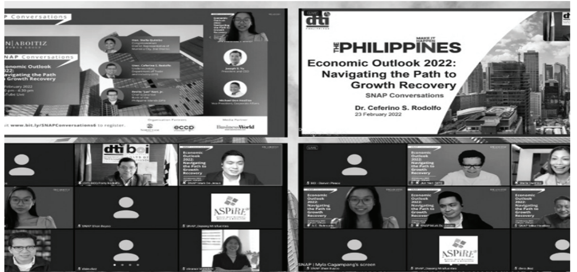
By PIA NCR