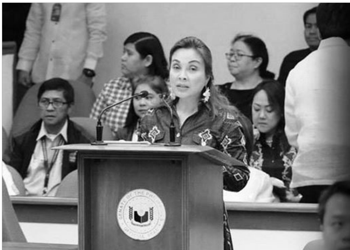
SENATOR LOREN LEGARDA