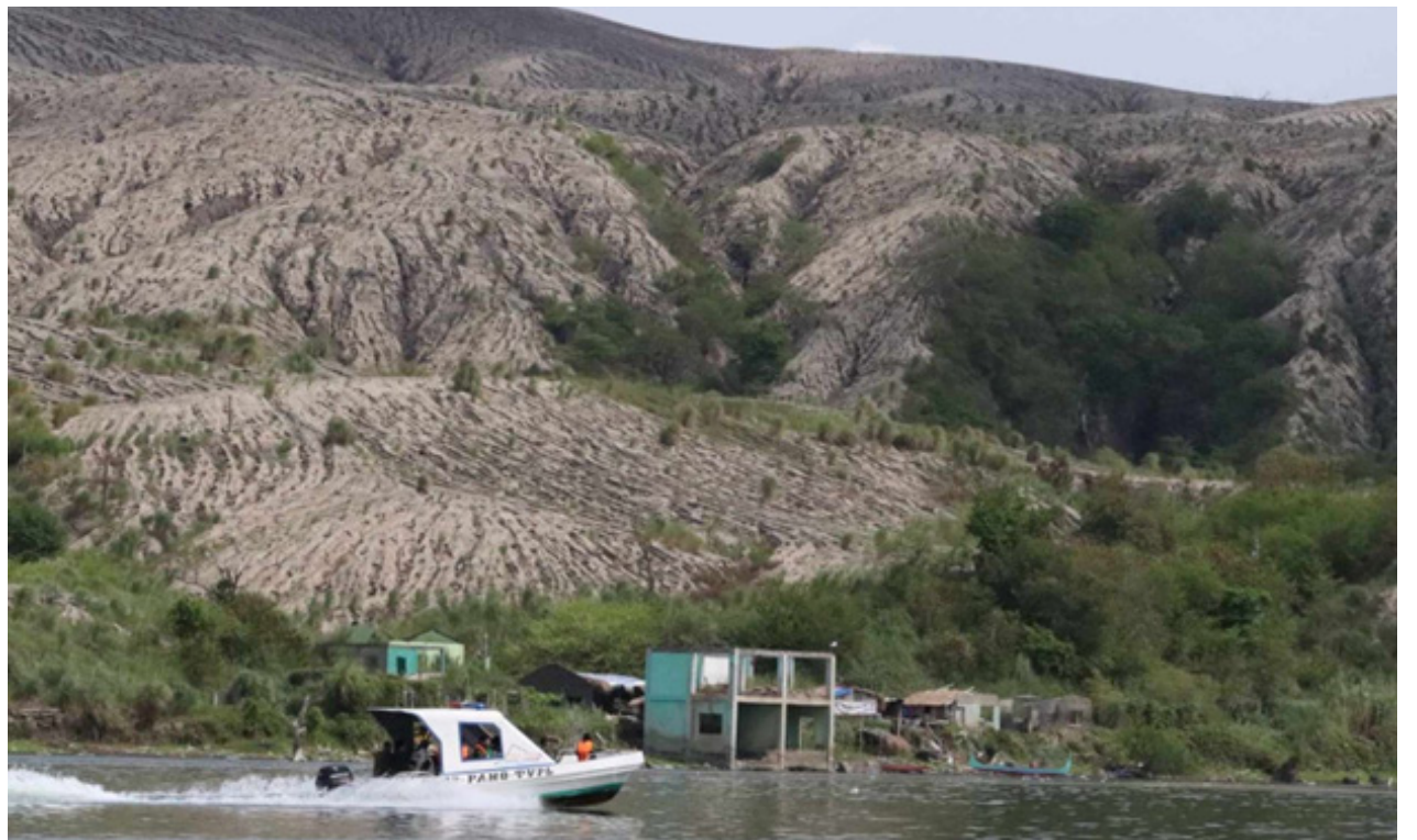
The Calabarzon disaster risk council creates special task forces to address complex hazards like the Taal Volcano eruption. The council recently inspected the Taal Volcano Island amid reported human activities around the lake.

Located in the south-western part of Luzon, the Calabarzon region consists of various land forms, including coastal areas and mostly upland interior areas with plains, mountains, and the Taal volcano. Surrounded by the Philippine Sea in the east, the Verde Island Passage in the South and Luzon Sea on the west, the region is vulnerable to natural calamities such as typhoons and volcanic eruption, as well as man-made disasters such as oil spills. (PB)