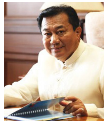
Davao del Norte 1st District Representative Pantaleon D. Alvarez (File photo)

Ang matagumpay na pagtatapos ng unang Command Conference para sa Paghahanda sa Plebisito ng Bacoor ay nagmarka ng isang mahalagang yugto sa mga pagsisikap ng Lokal na Pamahalaan ng Bacoor at COMELEC upang matiyak ang isang maginhawang at mapagkakatiwalaang plebisito. Sa aktibong pakikilahok ng iba't ibang mga stakeholder at sa pangako ng COMELEC at ng Pamahalaang Lungsod ng Bacoor, handa na ang Bacoor para sa isang patas at malinaw na plebisito sa Hulyo 29, 2023.