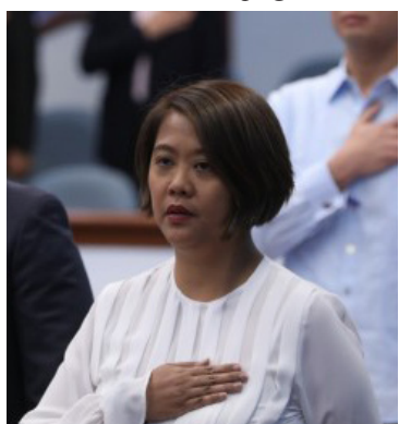
Senator Nancy Binay

"We need to accept that Continued on page 3