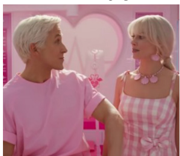
Ryan Gosling (left) and Margot Robbie (right) in the trailer of "Barbie" movie by Warner Bros. Pictures.

MANILA – A senator urged the Movie and Television Review and Classification Board (MTRCB) on Wednesday to block the upcoming screening of Warner Bros. Pictures' "Barbie" movie after the film's digital illustration of a scene with the so-called "nine-dash line" claim of the Chinese government of their supposed militaristic expansion in Continued on page 3