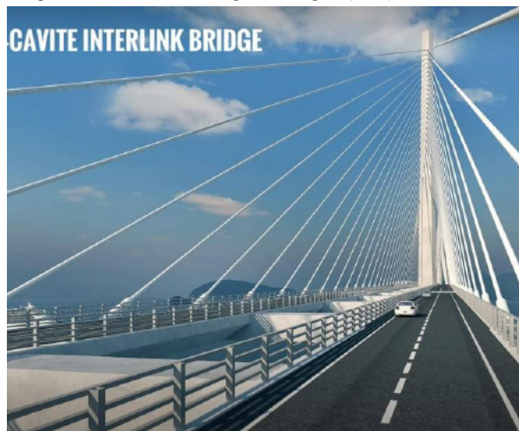
The design of the Bataan-Cavite Interlink Bridge project

The DED helped the government consider and resolve technical challenges, including "severe seismic loads, wind speeds, need for navigation channels for large cargo vessels, seabed depth for caisson foundation, and effects of climate change." (PNA)