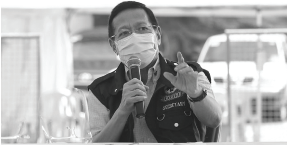
Health Secretary Francisco Duque III