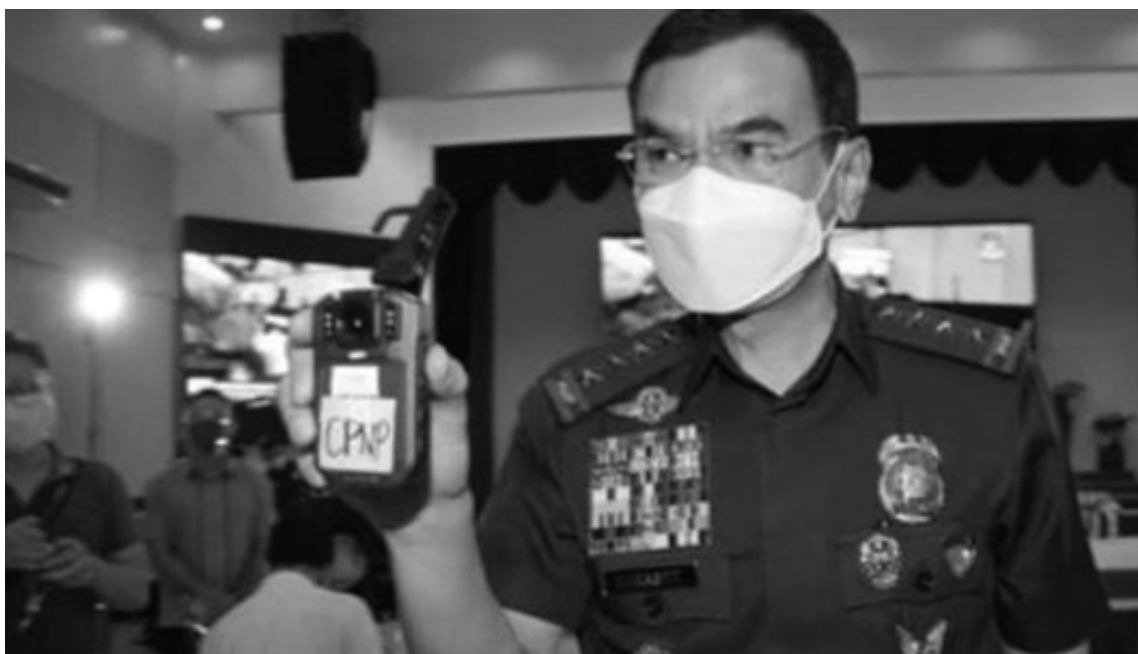
PNP Chief General Guillermo T. Eleazar holds a body worn camera to present to members of media on Friday, June 4.

It took the PNP some three years, since the program was first introduced, before finally utilizing the body-worn cameras to ensure the transparency and continue to page 2