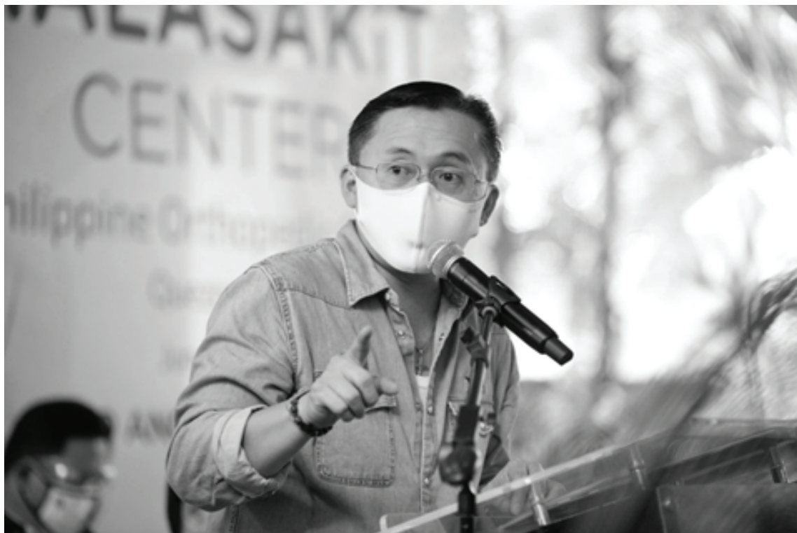
Senator Christopher "Bong" Go appealed to local government units and authorities in charge of the vaccine rollout to bring vaccines directly to constituents who are part of the priority groups to be inoculated.