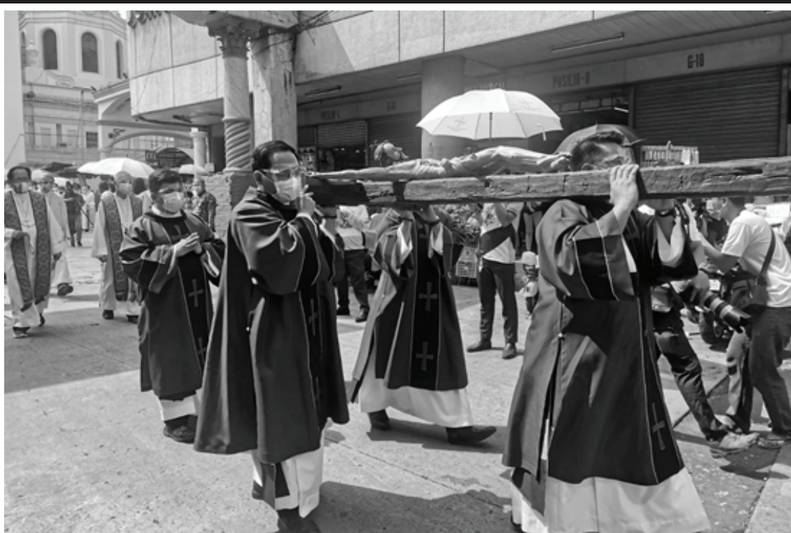
Priests carry a statue of the crucified Christ during a "penitential walk" from Quiapo Church to Sta. Cruz Church in Manila.

The CBCP added that nearly half of the archdiocese's diocesan priests attended the religious activity. (PIA NCR)