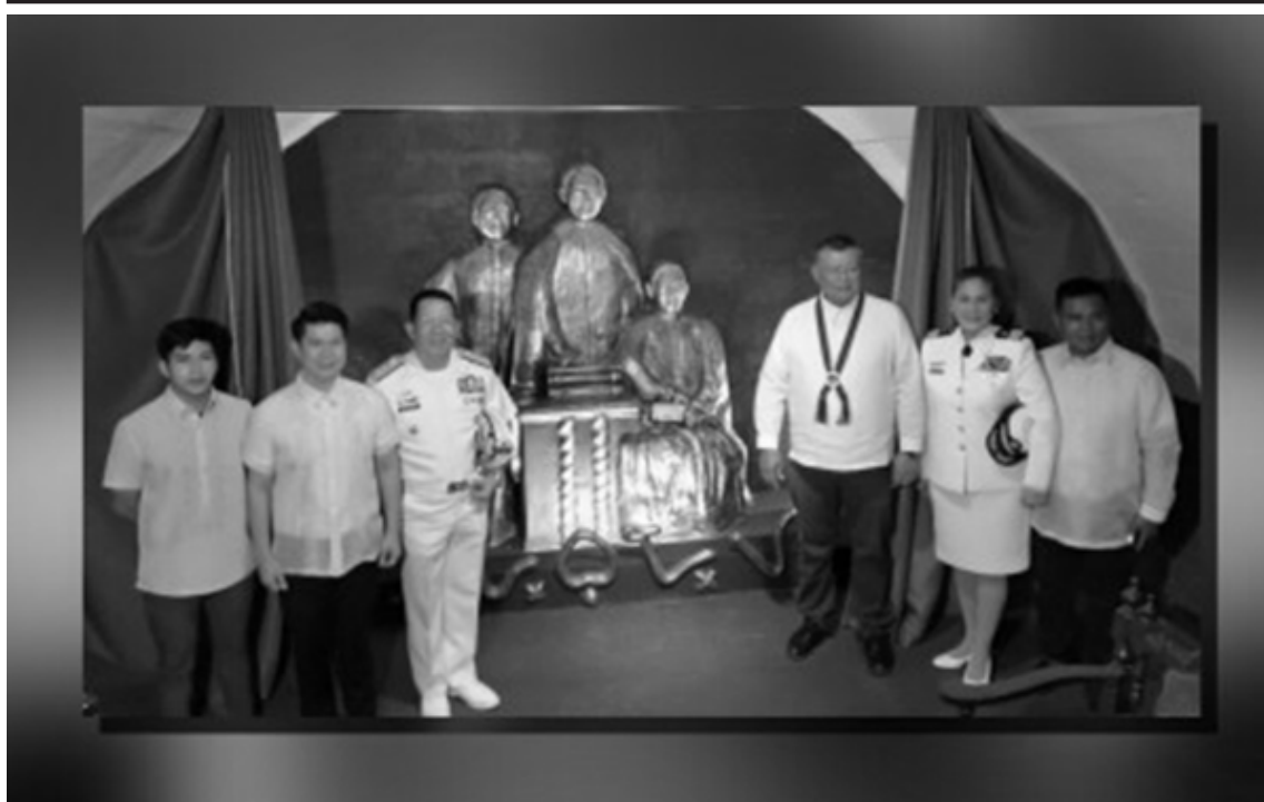
HONORED. The martyrdom of the three Filipino Catholic priests, Mariano Gomez, José Burgos, and Jacinto Zamora (GOMBURZA) is honored with a sculpture unveiled inside a 430-year-old museum in Cavite City on Thursday (Feb. 23, 2023). The impact of their martyrdom lasts forever, according to Justice Secretary Jesus Crispin Remulla (third from right), who led the unveiling.