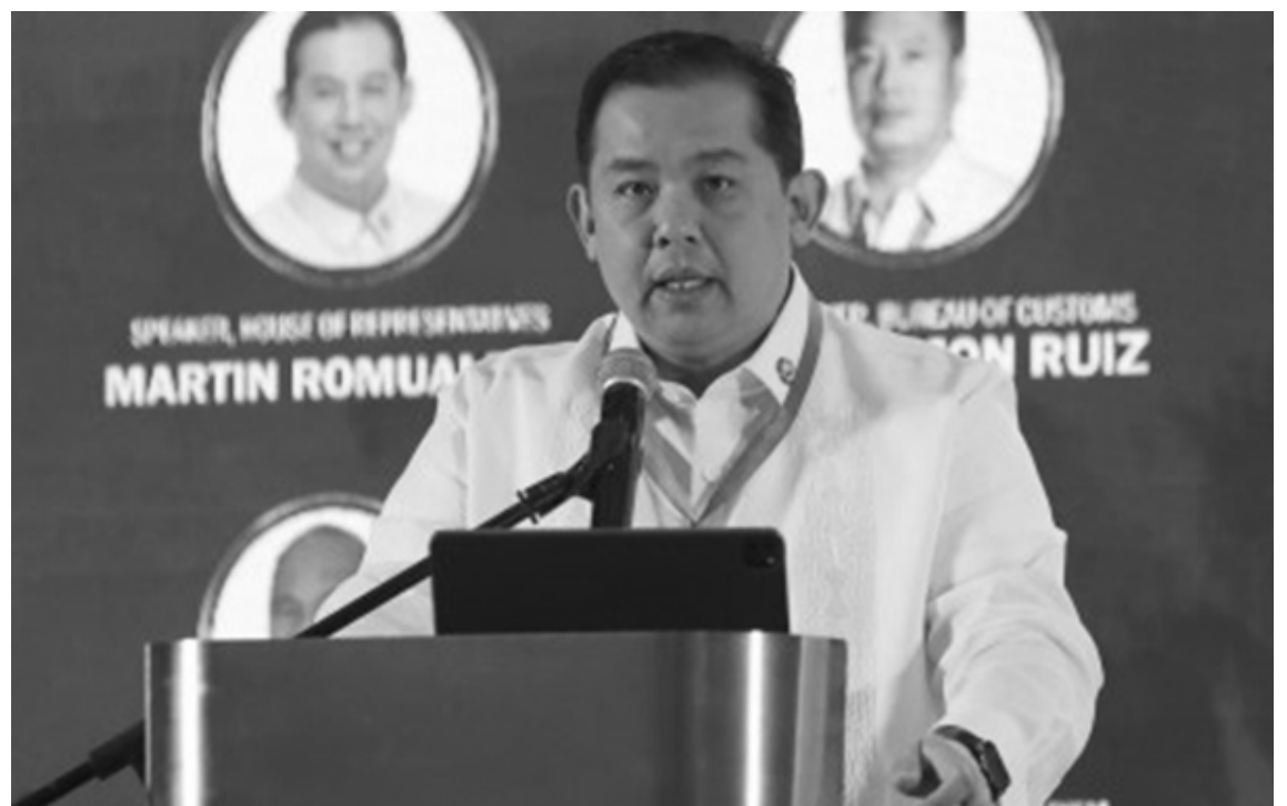
House Speaker Martin Romualdez (File photo)