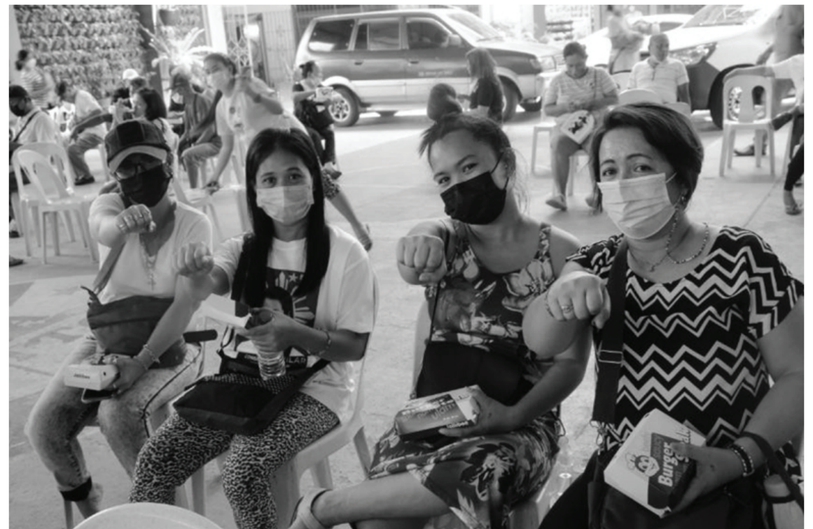
By PIA NCR