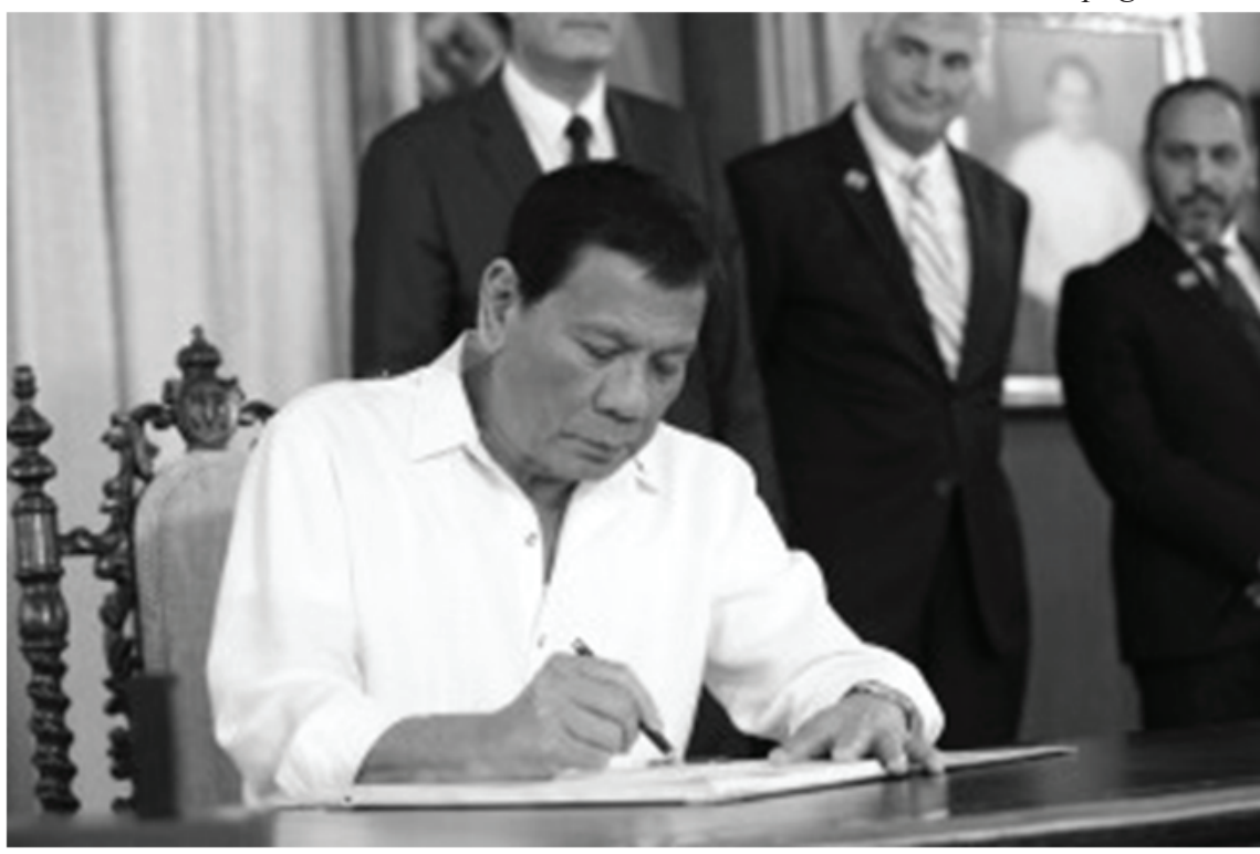
President Rodrigo Roa Duterte