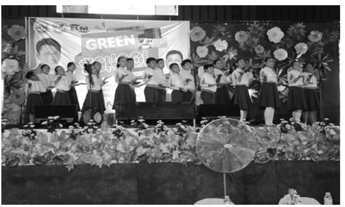
Students from Imus National High School-Main campus hops and sings as the the city government launches the first Green School Program which will help in the promotion of environmental awareness and care for Mother Nature.