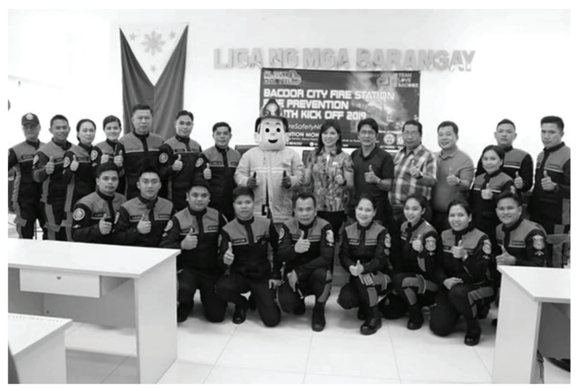
Fire Prevention Month: Bacoor City Mayor Lani Mercado Revilla (in blue shirt) joins the Bureau of Fire Protection (Bacoor City Fire Station) officials during the city's fire prevention activities. A Memorandum of Agreement was signed between the Bureau of Fire Protection-Bacoor City Fire Station and the Liga ng mga Barangay. Said agreement which is under the Oplan Ligtas na Pamayanan, will involve a program to increase the number of trained and organized communities to serve as partners in fire protection efforts, decreasing the occurrence of fires in the most vulnerable parts of communities, and encouraging communities to develop a Community Fire Protection Plan. (Ruel Francisco, PIA-Cavite/photo courtesy by Bacoor PIO)