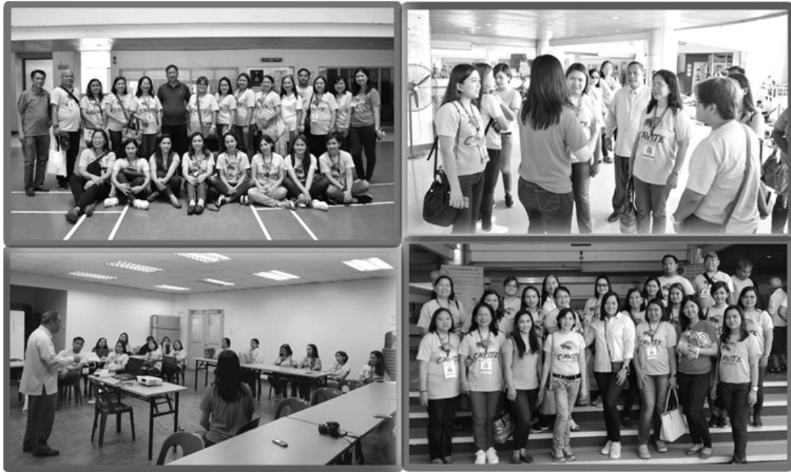
Learning visit to Los Baños Cavite GFPS