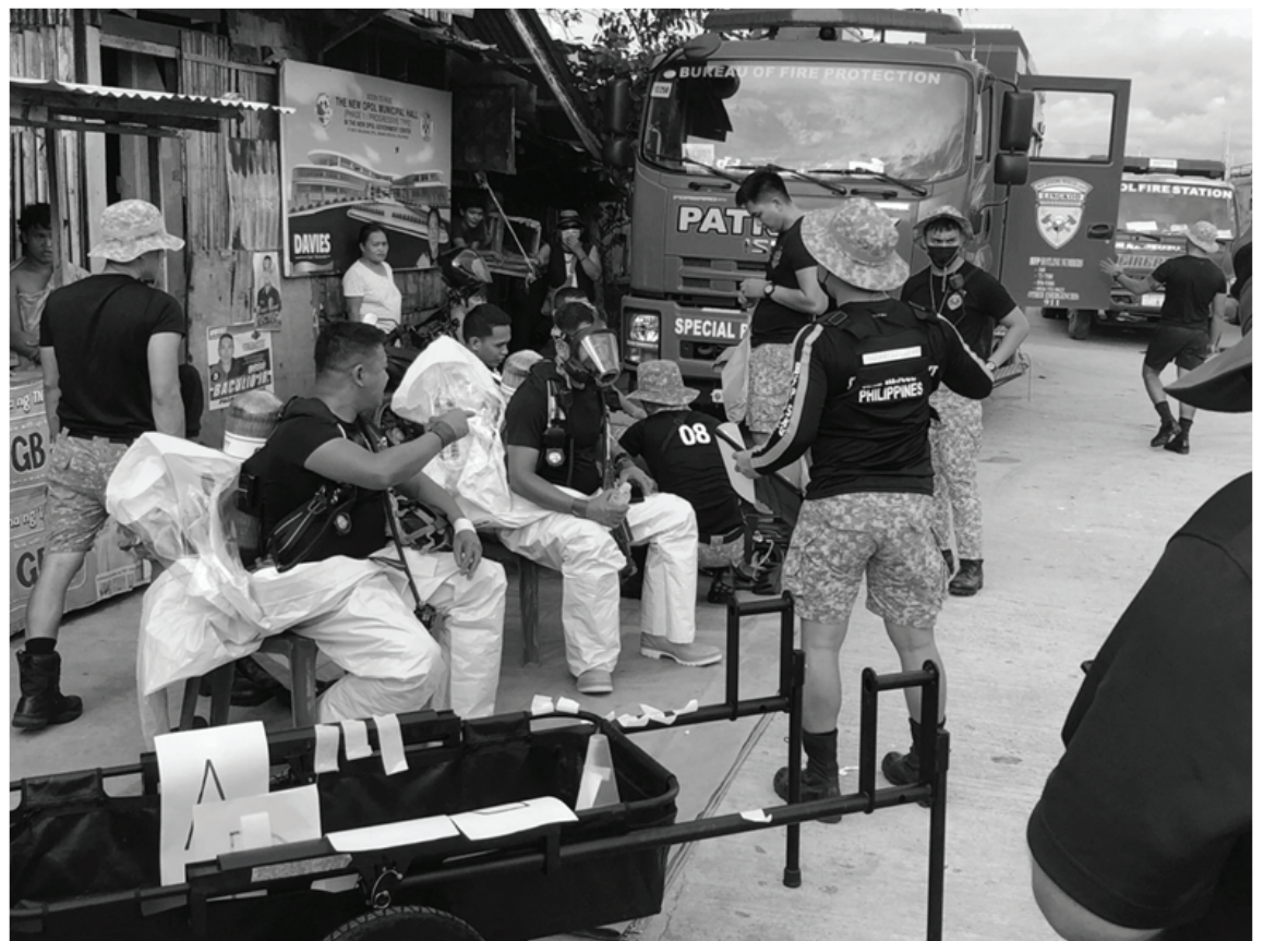
Firefighters from the Philippine Bureau of Fire Protection participate in the U.S. Defense Threat Reduction Agency's two-week training course on countering weapons of mass destruction, which focused on the risks that first responders face when encountering a Chemical, Biological, Radioactive and Nuclear incident.