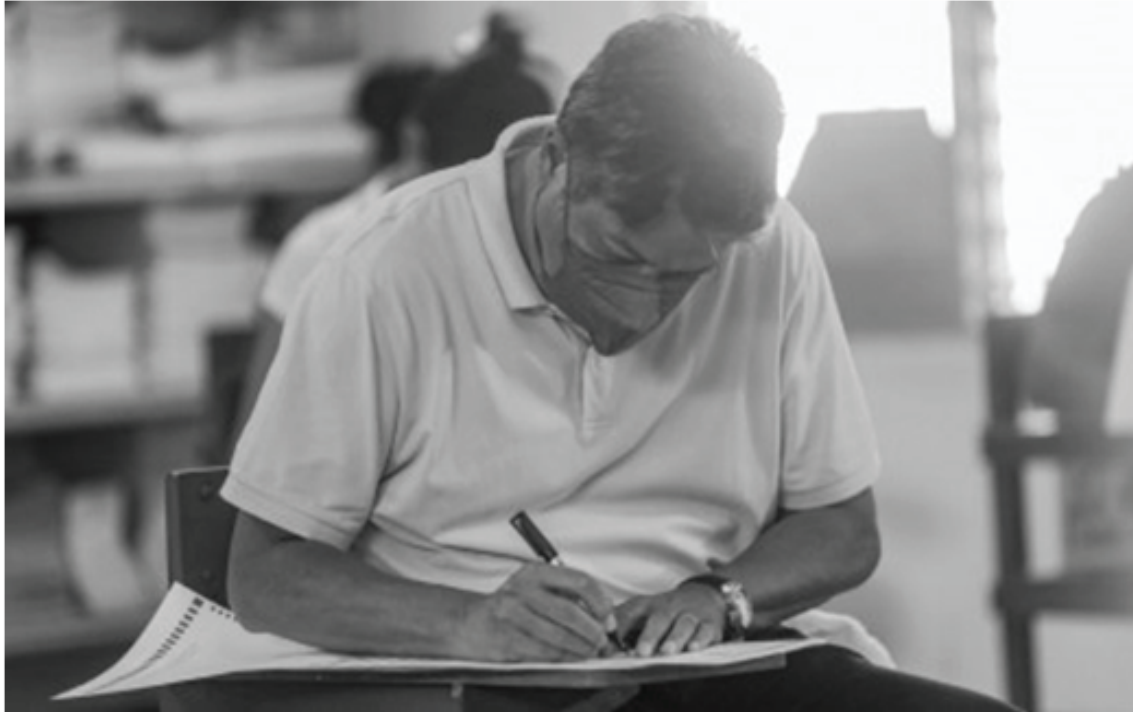
SECURE YOUR BALLOTS. Vice presidential candidate Francis "Kiko" Pangilinan queued for over three hours to cast his vote for the 2022 polls at the Inchican Elementary School in Silang, Cavite. He is urging voters and watchers to have patience and guard their ballots.