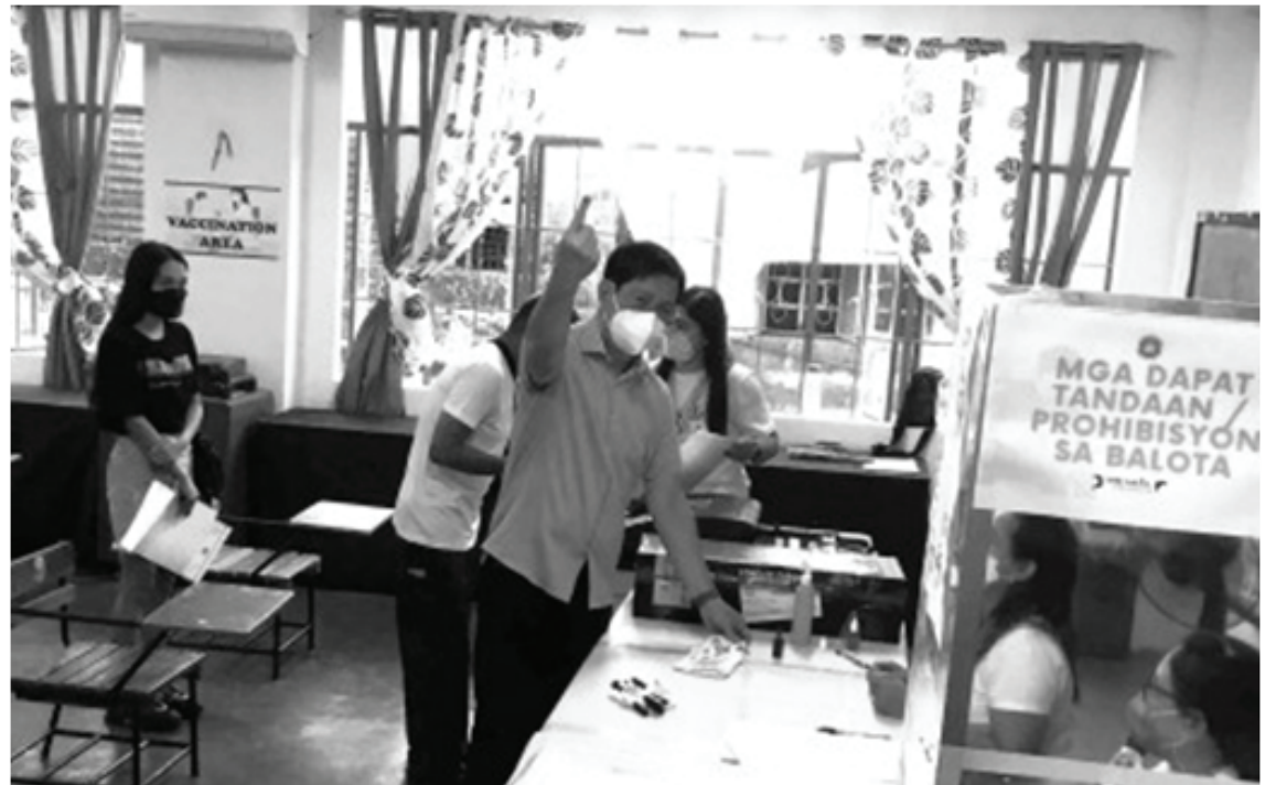
VOTED. Presidential aspirant Senator Panfilo Lacson raises his inked finger at the Bayan Luma 1 Elementary School in Imus City, Cavite on Monday morning (May 9, 2022). He said whatever the results might be, he is hoping candidates would let go of all hatred and animosities.

“There is no substitute to a clear conscience. We ran this campaign as honestly. Ang daming level ng (So many levels of) discourse. And for that, we are thankful that we are able to maintain what we have started. After today, lahat burado na, para bang (let’s delete everything, like we) start from zero, start from the starting line,” he said. (PNA)