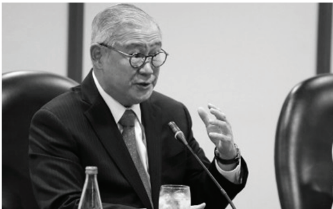
Foreign Affairs Secretary Teodoro L. Locsin, Jr.

A self-generated show cause order is sent online to the establishment, giving it 24 hours continue to page 2