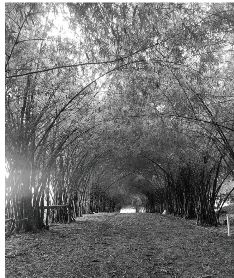
Walking under this bamboo canopy can give you sense of ease at the Caranguian Integrated Farm.