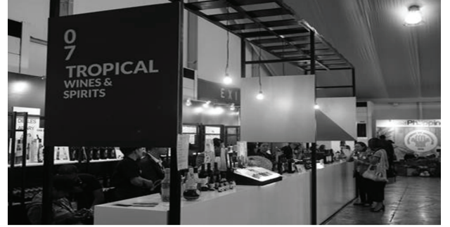
The Tropical Wines and Spirits special setting at the IFEX Philippines NXTFOOD ASIA.

IFEX Philippines NXTFOOD ASIA is organized by the Department of Trade and Industry (DTI) through the Center for International Trade Expositions and Missions (CITEM), and co-organized by DTI's Micro, Small and Medium Enterprise Development (MSMED) Council, the Department of Agriculture (DA) and the Philippine Exporters Confederation, Inc. (PHILEXPORT). (DTI-CITEM)