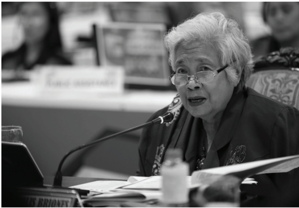
DepEd Secretary Leonor Magtolis Briones led the press conference as part of the launch of the 2019 Oplan Balik Eskwela.