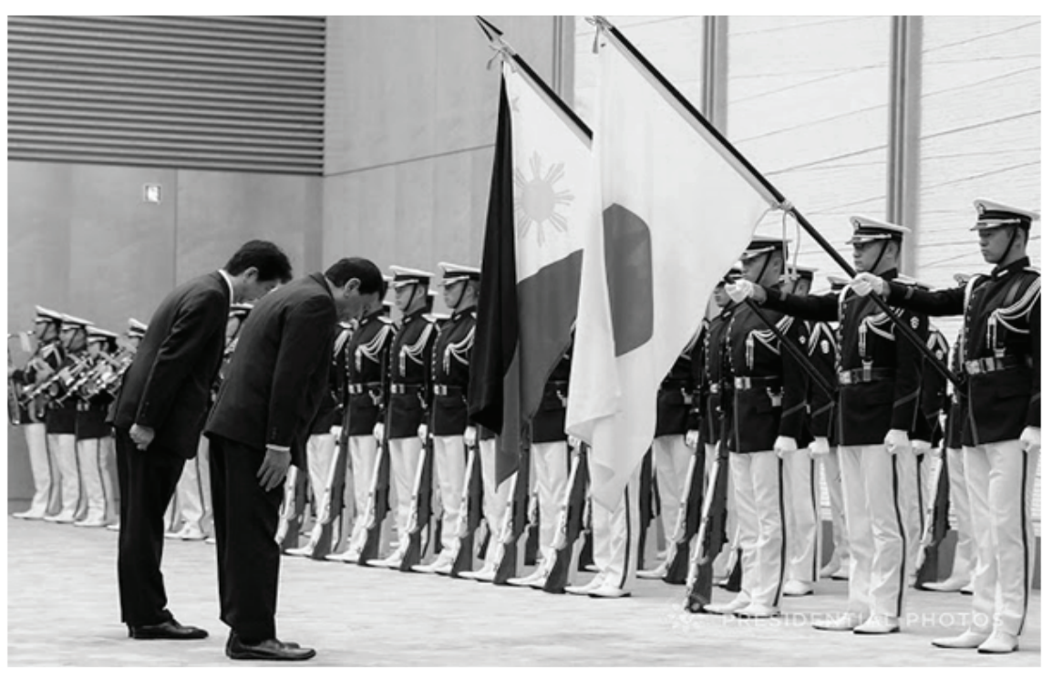
President Duterte's visit to Japan in October 2017.